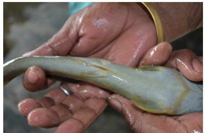
Fig 5: 13 days after dissection.