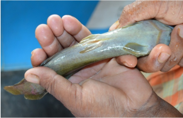
Fig 6: 30 days after dissection