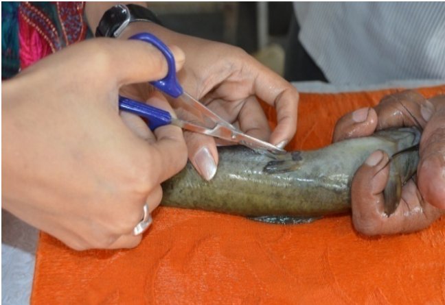
Fig 2: Dissection of male Magur