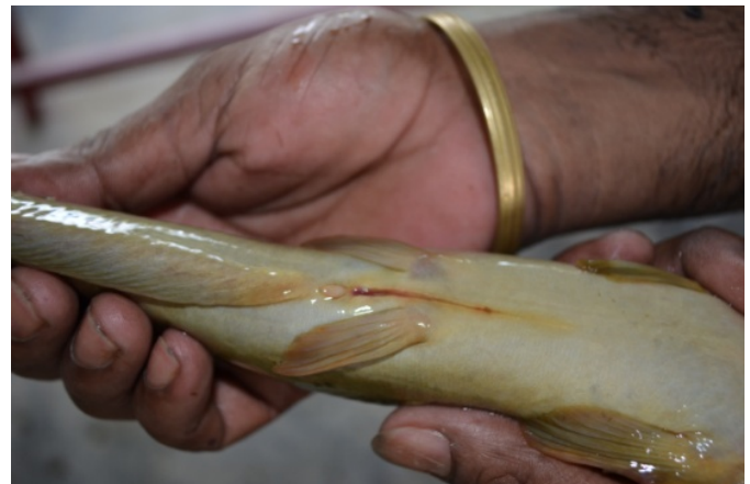
Fig 4: 7 days after dissection.

It was observed that around 90% of the fishes remained alive. More surprisingly, it was observed that without any stitching or without any medication, the slit in the abdomen started healing after 4-5 days. No abnormal behaviour was observed in the fish during these days, while the wound gradually healed up. In the beginning of the process a thin membrane was observed covering the wound, which became thicker as the days went by and finally the slit was joined. Within 30-35 days, the process of self-healing was completed and the cut mark almost vanished, (Fig: 4-7). This amazing observation revealed that the fish has an astonishing capacity of self-healing through regeneration of damaged tissue. There may be some special component in this species which is responsible for this unique process of self-healing.