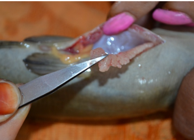
Fig 3: Removal of testis