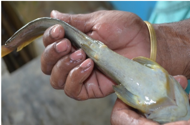
Fig 7: 41 days after dissection

A review of literature revealed that in animals with regenerative ability, protective layers of tissue cover the site of injury and the cells underneath transform into progenitor or stem cells forming a growth zone termed as blastema. The blastema then generates the new cells of various kinds as per requirement by interacting with the epithelium of the wound [1]. Such regeneration process of limbs and heart in zebra fish has been reported recently by Anna Jazwinska and her team at